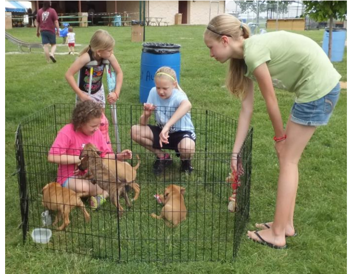
A pile of new puppies always gets lots of attention at a CCHS Meet and Greet.

The CCHS parade unit also participated in the parade.