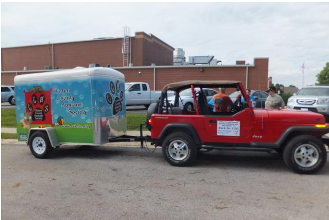
Though threatening weather sidelined the CCHS float, the custom painted trailer filled in nicely for the Aviston 150 Celebration parade.