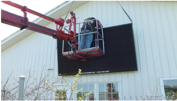
The new digital sign was hoisted into position by crane and installed by a worker in a cherry picker April 23.

The sign was ordered from and installed by T. Ham Sign, Inc.