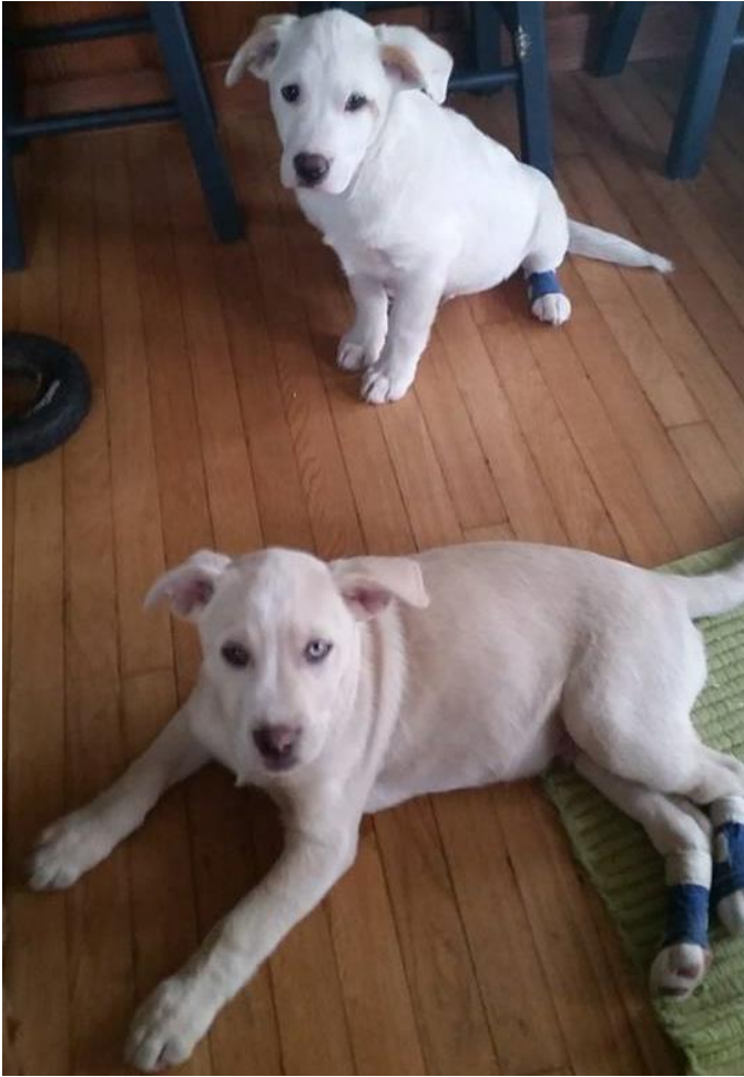
Zinc and Jasper