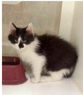
Flicker , Black and white