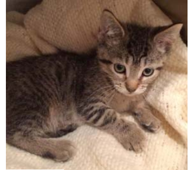
Shubert Brown tabby