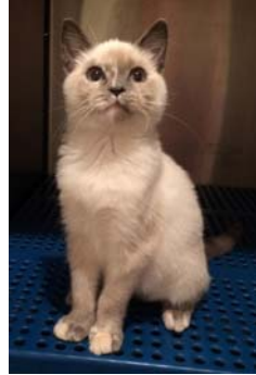
Arena , Siamese mix