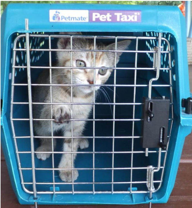
Little Daisy was hoping for some time out of her carrier.