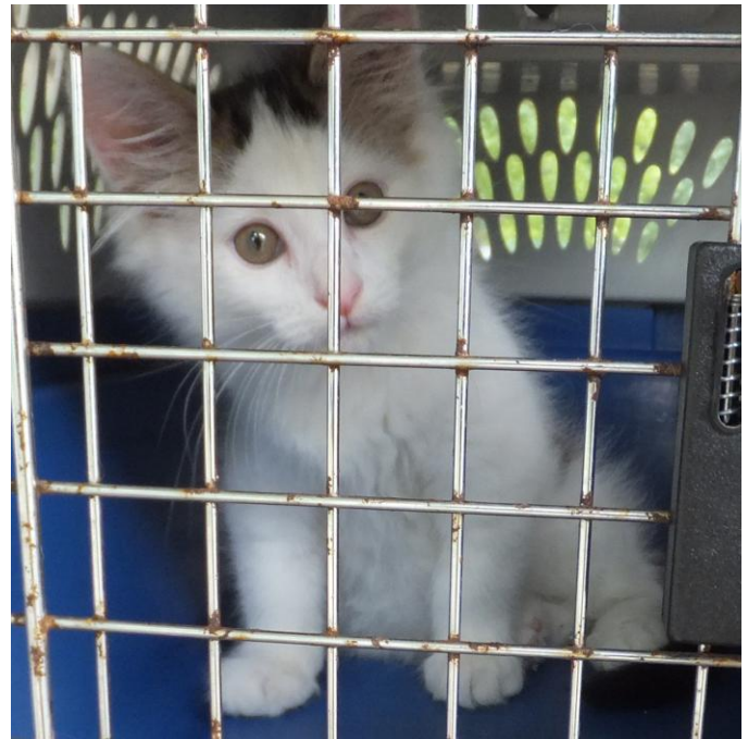
Mosely watched her first Meet and Greet from the safety of her carrier.