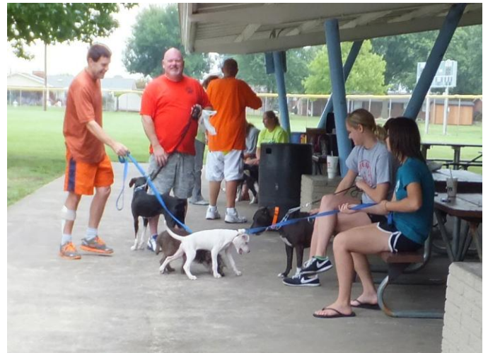
Visitors, volunteers and pets did some meeting and greeting Saturday at Breese North Side Park.